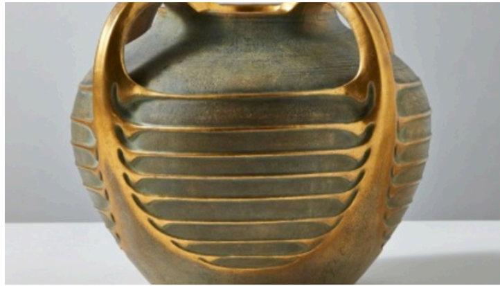
Das Werk.

The exhibition presents color prints from Klimt's Das Werk series, made between 1908 and 1914, which includes some of his most iconic masterpieces such as The Kiss, Judith I, and Emilie Flöge. Three exceptional additions to the show are black-and-white collotypes based on the controversial paintings that originally decorated the ceiling of the Great Hall at the University of Vienna, and were destroyed during World War II.