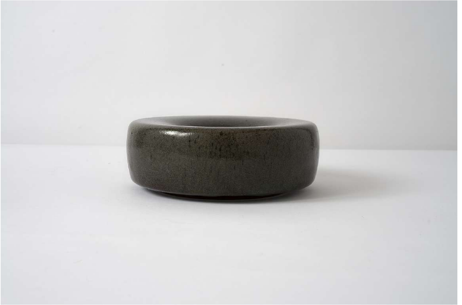
Ursula Scheid Untitled Glazed Stoneware 3.75h x 10w x 10d in SCU012 $ 7,000.00