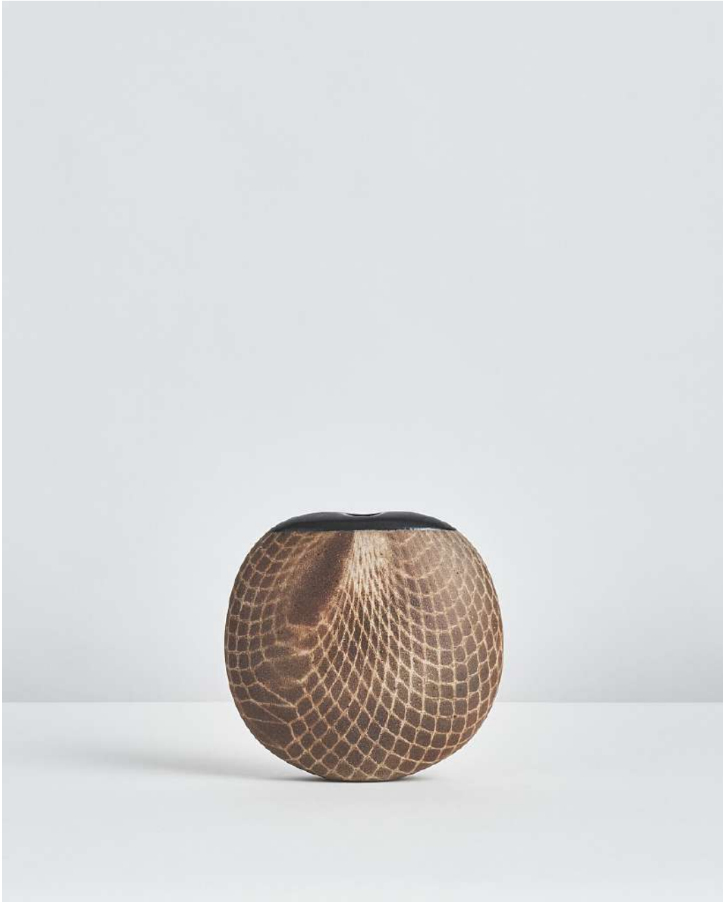
Gotlind Weigel Untitled Glazed stoneware 6.50h x 7w x 3d in WEG005 $ 4,000.00