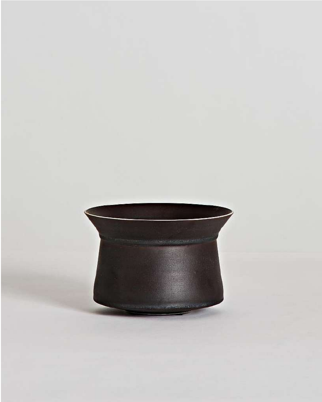
Ursula Scheid Bowl , 1986 Glazed Stoneware 4.25h x 6.25w in SCU005 $ 8,000.00