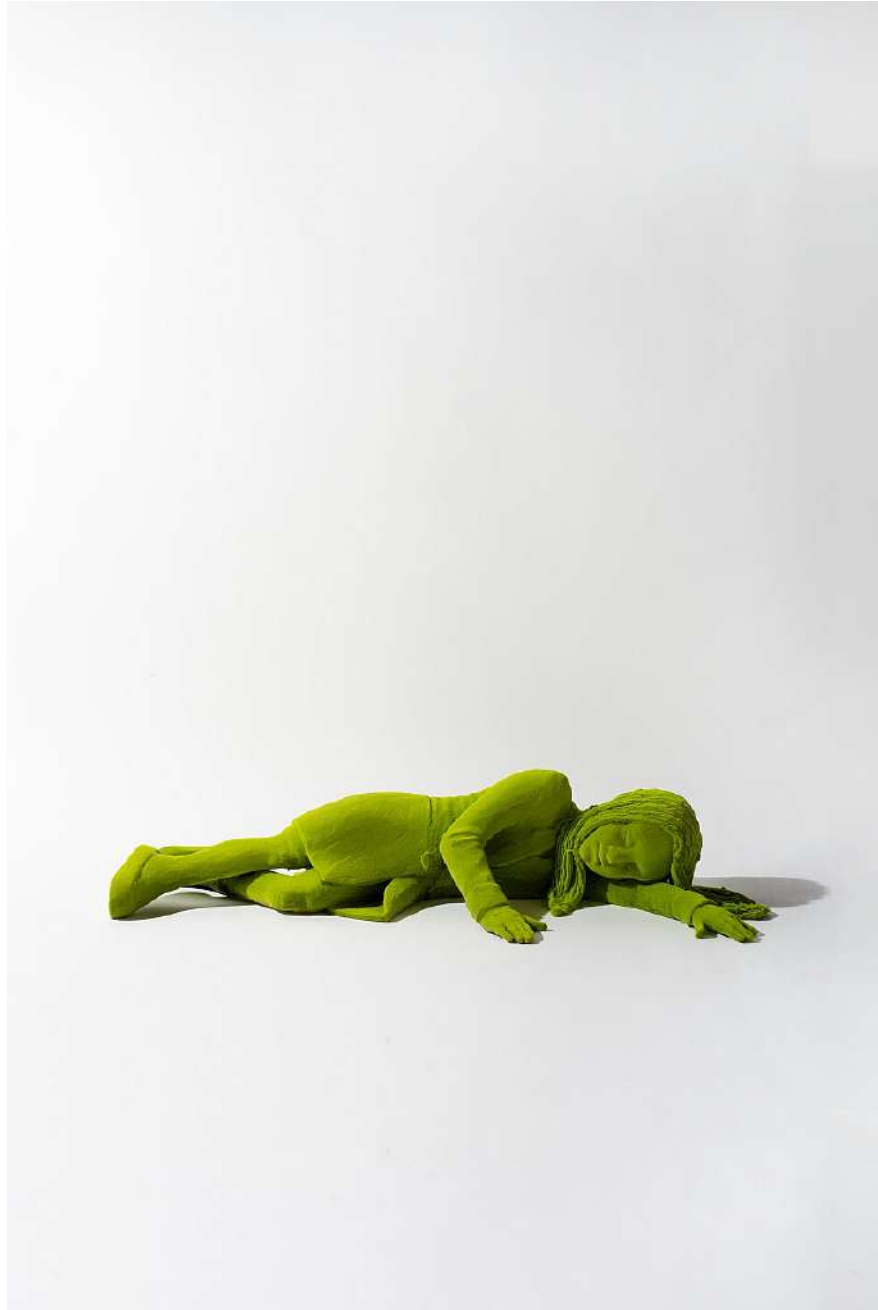
Kim Simonsson Sleeping Moss Girl , 2022 Stoneware, epoxy resin, and nylon fiber 13.78h x 41.34w x 17.72d in SIK185 $ 35,000.00