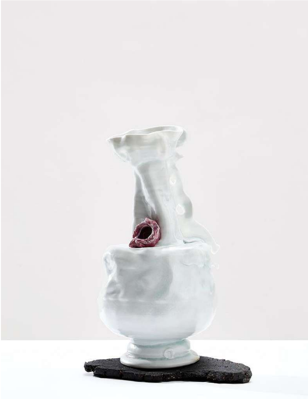
Gareth Mason Ewer in a Black Space , 2016 Porcelain and coarse black clay, two satin glazes and distressed pink lustre 14.75h x 11w x 8d in MAG245 $ 7,500.00