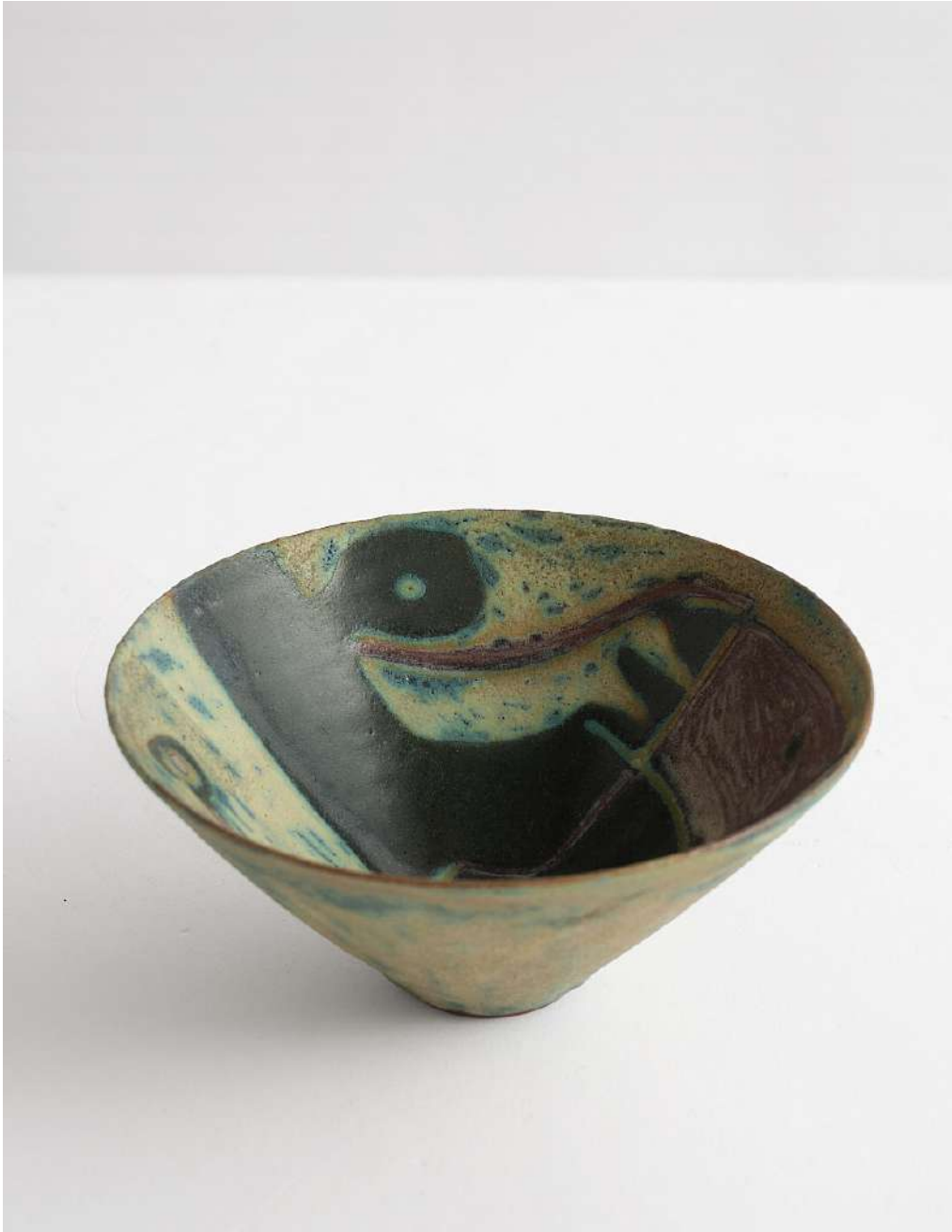
Beate Kuhn Small bowl , c. 1950s Ceramic bowl 2.36h x 5.12w x 5.12d in KUB078 $ 4,200.00