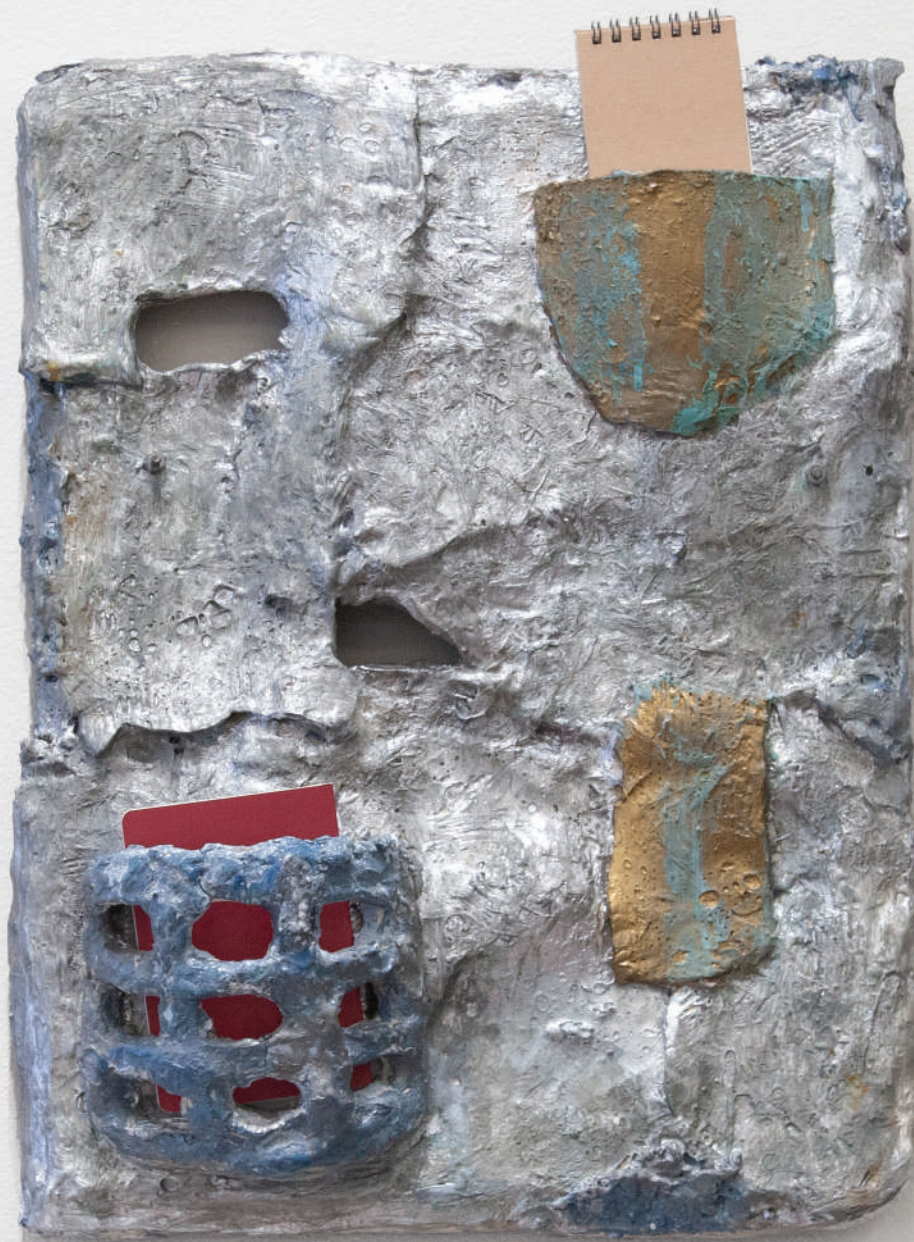
Jillian Mayer Marker Holder, 2024 15 x 18 x 4 in Bronze plate, copper plate, ceramics, glazes, resins, and office supplies $ 6000