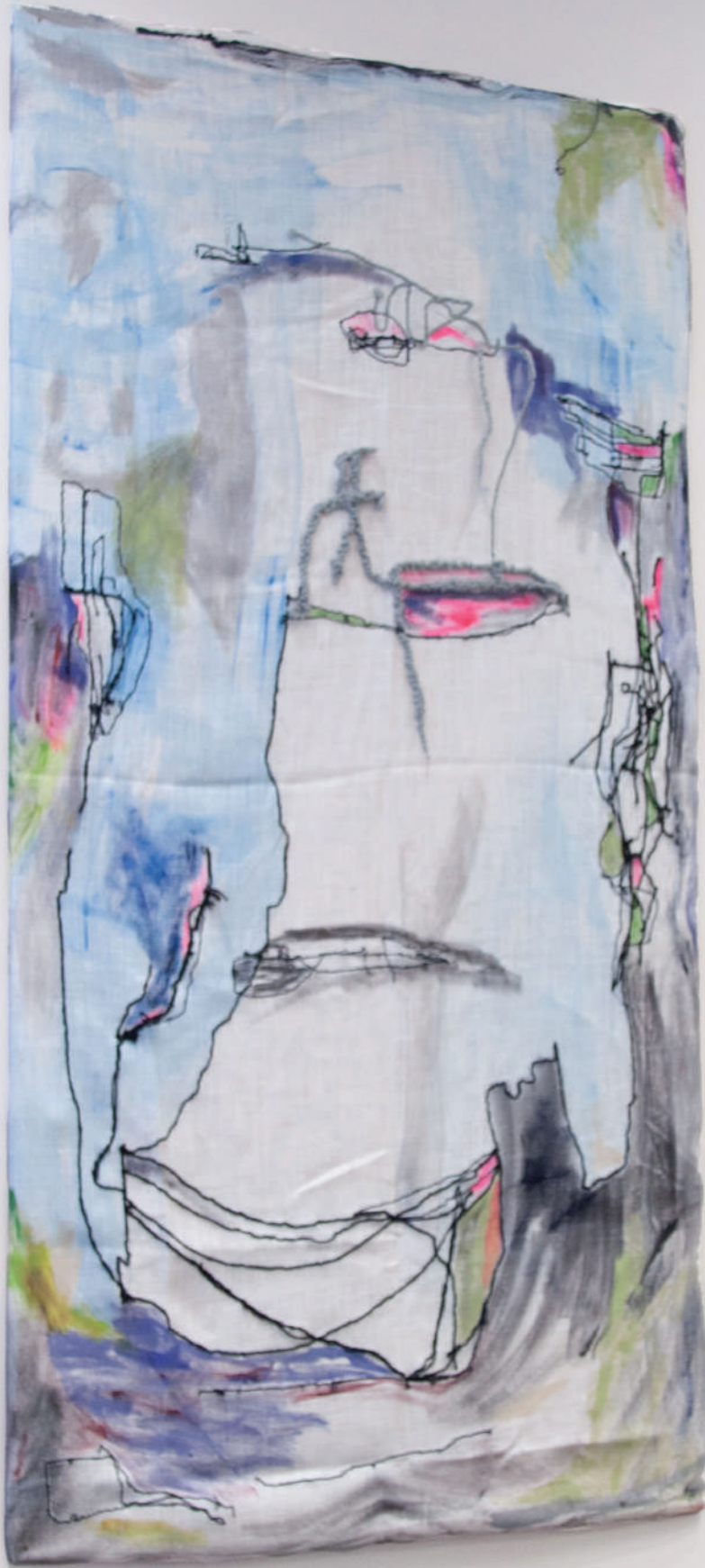
Jillian Mayer Monks fabric, ink, acrylic, yarn 82 x 44 inches $ 20,000