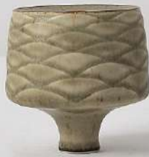
Karl Scheid Untitled , 1974 Glazed Stoneware 3.50h x 3.25w x 3.25d in SCK026 $ 4,200.00