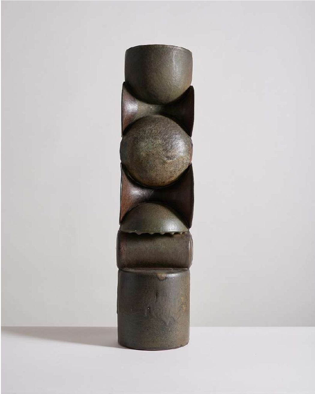
Beate Kuhn Pillar , c. 1970 Stoneware 34.25h x 8.46w x 8.46d in KUB076 $ 65,000.00