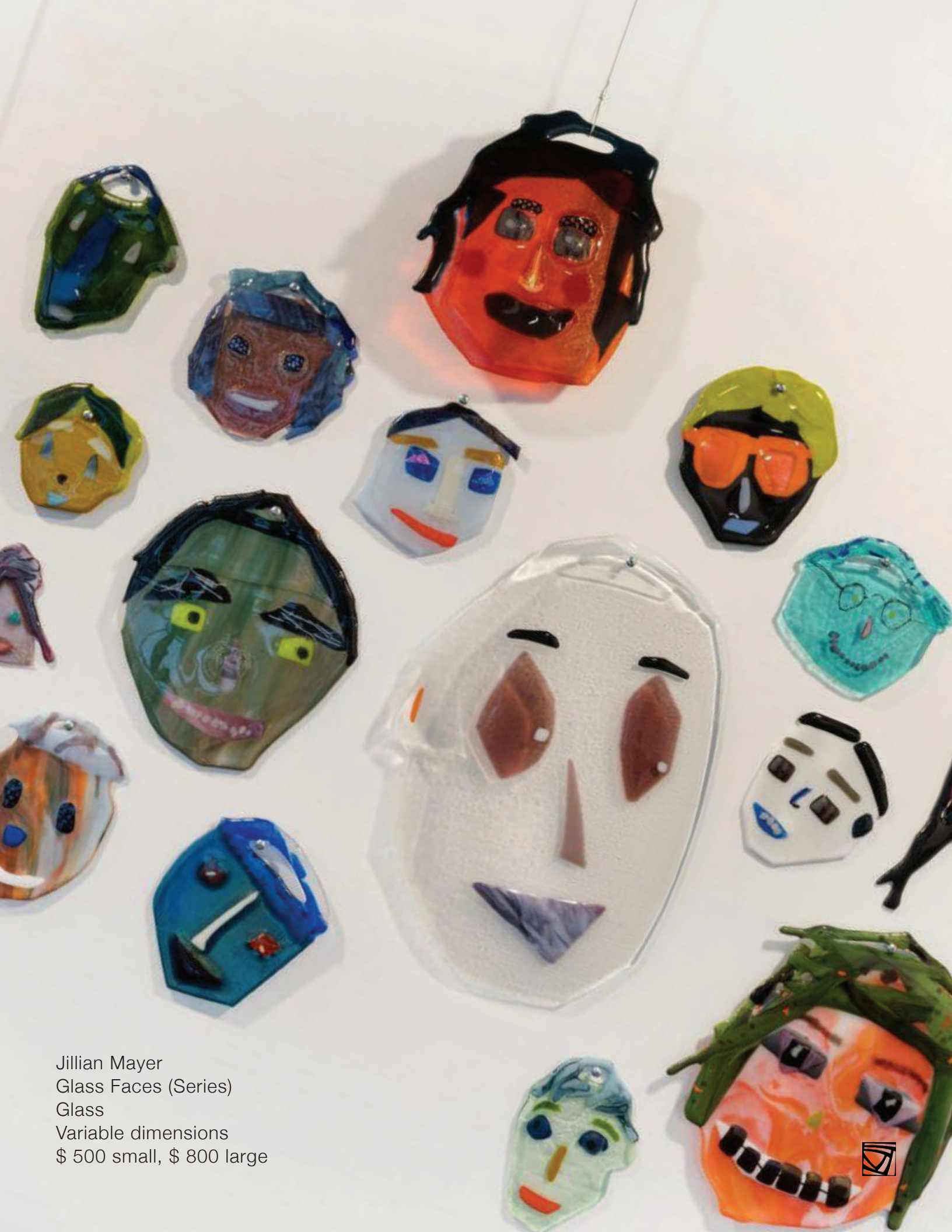
Jillian Mayer Glass Faces (Series) Glass Variable dimensions $ 500 small, $ 800 large