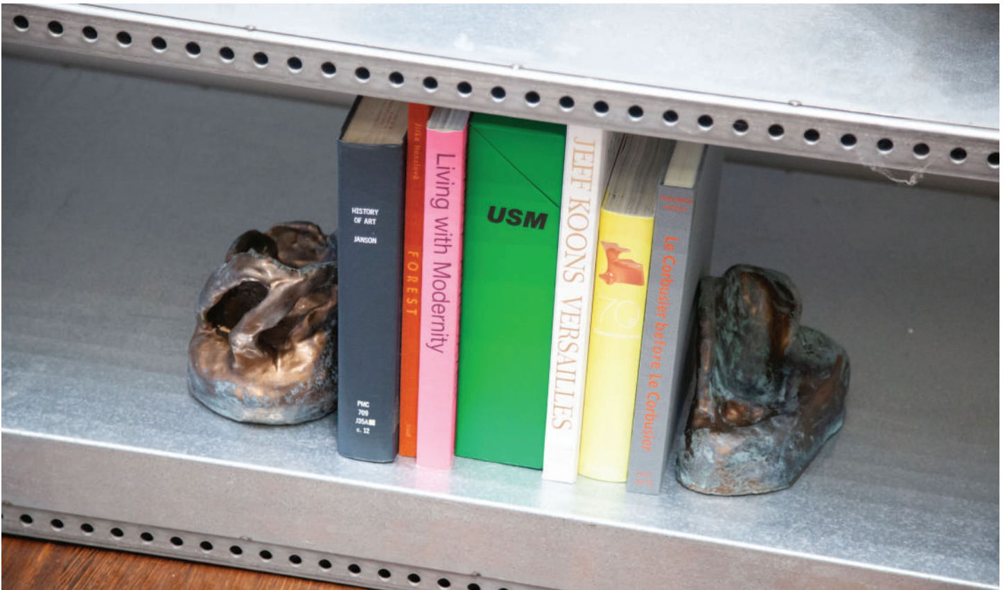
Jillian Mayer Small Slumpie Models (book-ends) - Bronze coated, Tiffany patina, ceramic $ 3000