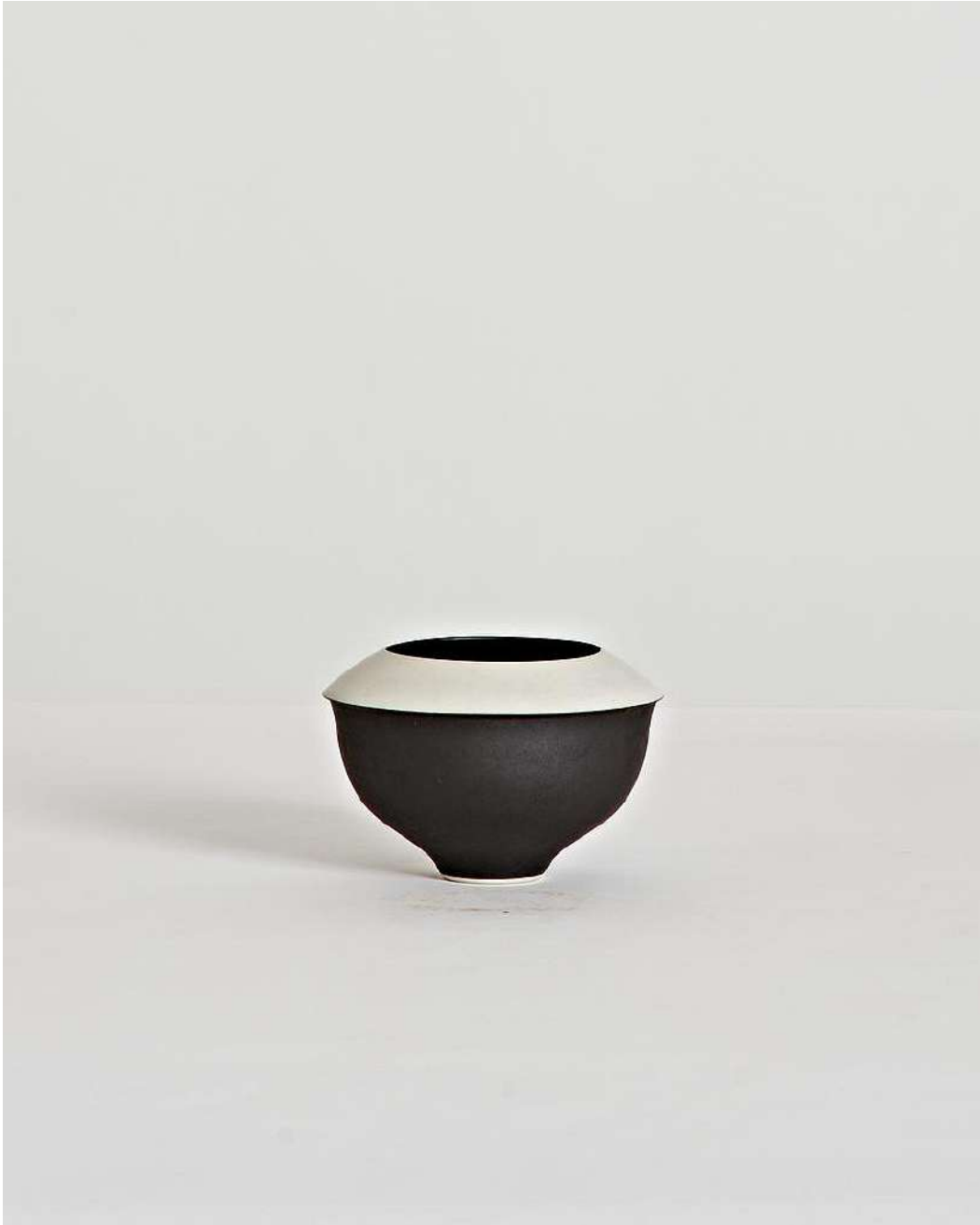
Karl Scheid Elegant Bowl , 1979 Porcelain 2.95h x 4.33w in SCK011 $ 4,500.00