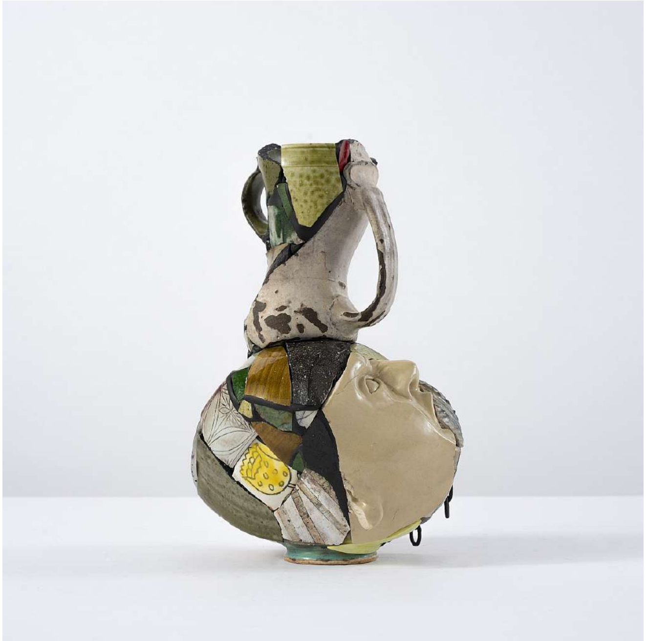
Chase Travaille Shard Amphora No. 13, 2022 Ceramic shards, Epoxy 12h x 8w x 6d in CTR001 $ 2,500.00