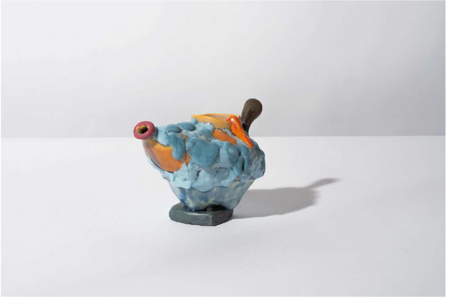
Nick Weddell I Kissed my Own French Fry , 2021 Glazed porcelain 4.50h x 7.50w x 4.50d in NIW0120 $ 2,400.00