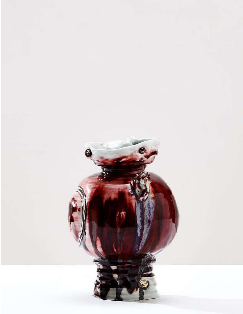
Gareth Mason Undercherry , 2016 Porcelain, celadon, copper red, jun, flux, oxide, gold lustre 11h x 8w x 8d in MAG237 $ 5,500.00