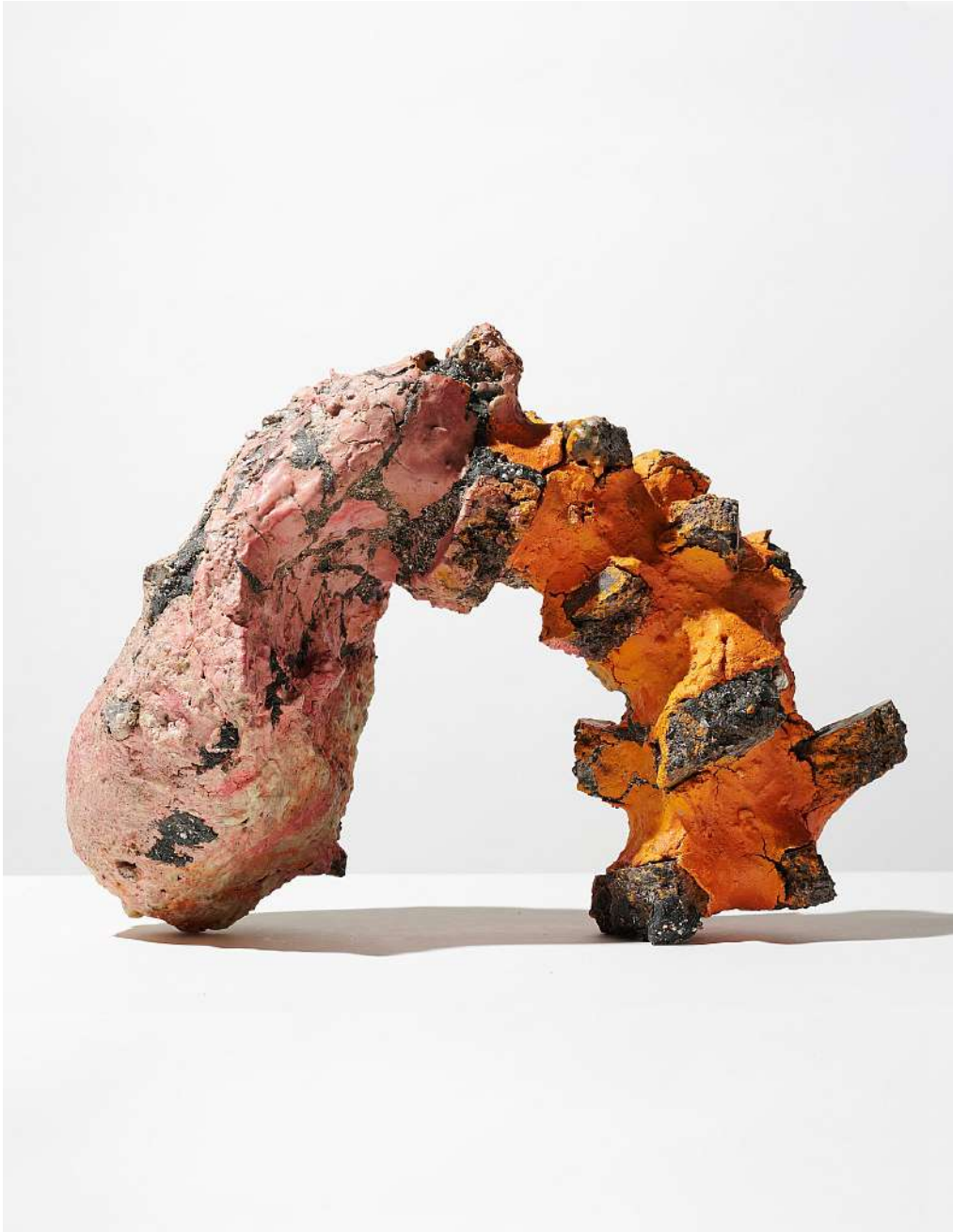
Aneta Regel Ula , 2018 Glazed stoneware, porcelain, and mixed media 9.75h x 15.75w x 11d in REA115 $ 9,500.00