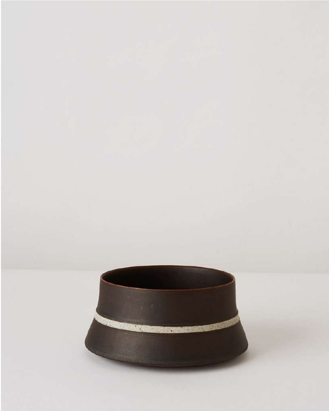
Ursula Scheid Low Vessel with Stripe , 1986 Stoneware 3.35h x 7.48w x 7.48d in SCU009 $ 9,000.00