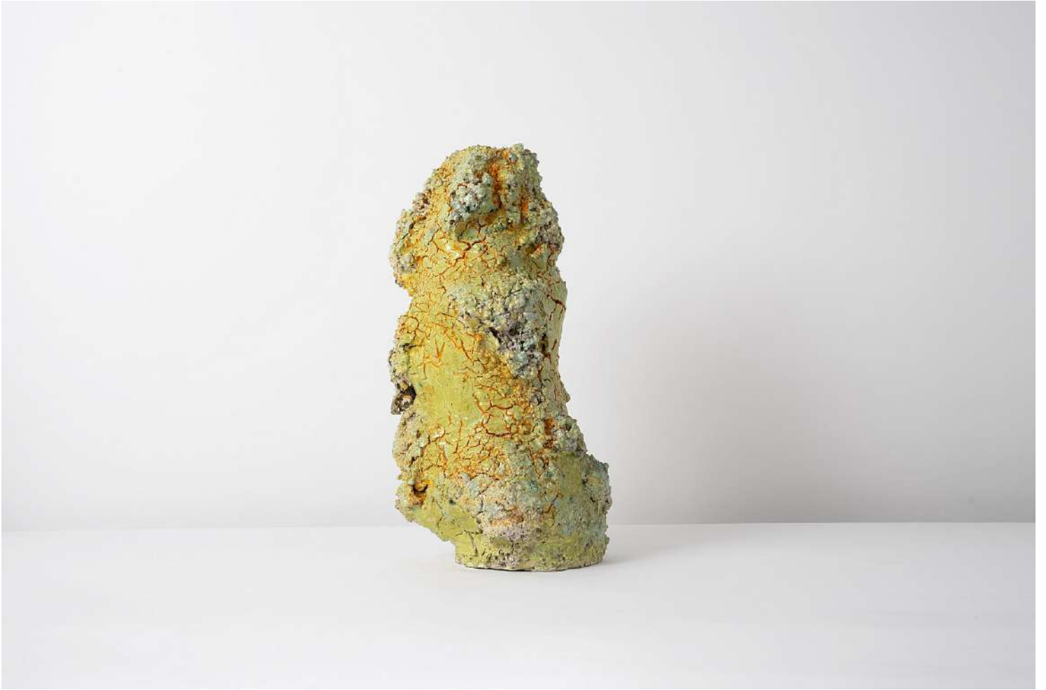
Aneta Regel Green Raining Stone , 2017 Glazed porcelain, porcelain, and volcanic rock 23h x 12w x 12d in REA128 $ 18,000.00