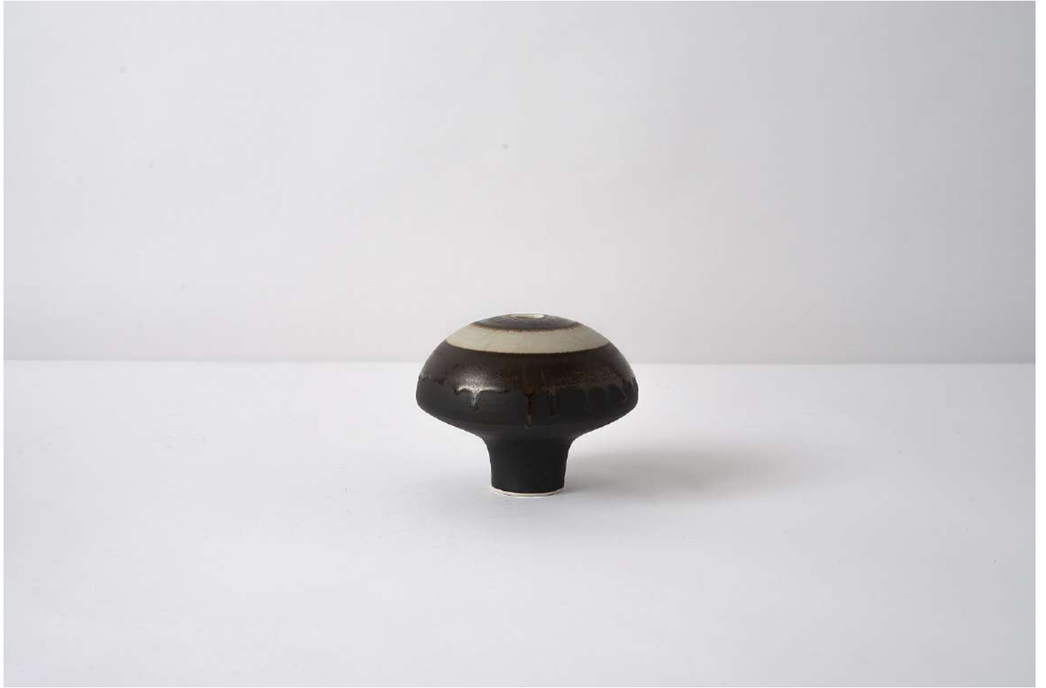
Karl Scheid Untitled , 1969 Glazed Stoneware 4h x 5.25w x 5.25d in SCK029 $ 7,000.00