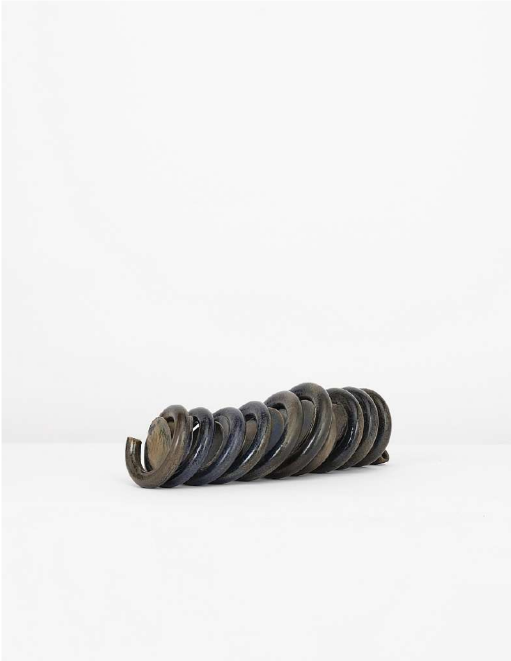
Beate Kuhn Spiral with plates , c. 1970 Glazed Stoneware 5.51h x 16.54w x 5.51d in KUB094 $ 24,000.00