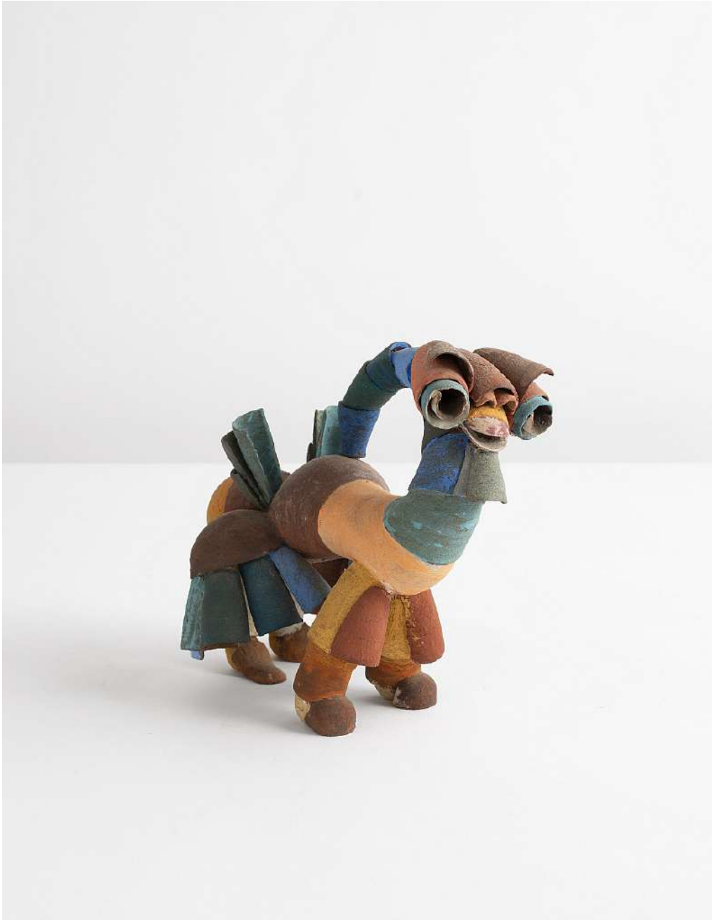
Beate Kuhn Monster , c. 2010 Glazed Stoneware 7.09h x 8.27w x 5.12d in KUB092 $ 15,000.00