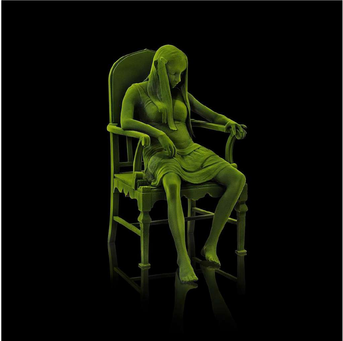
Kim Simonsson Sleeping Mosswoman , 2015 Stoneware, nylon fibre, and wooden chair 90h x 80w x 50d in SIK012 $ 75,000.00