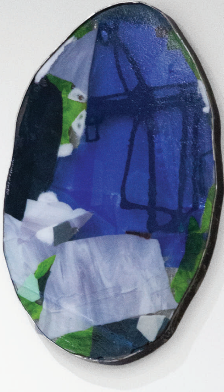
Jillian Mayer 2022 Steel, cast glass $ 6000