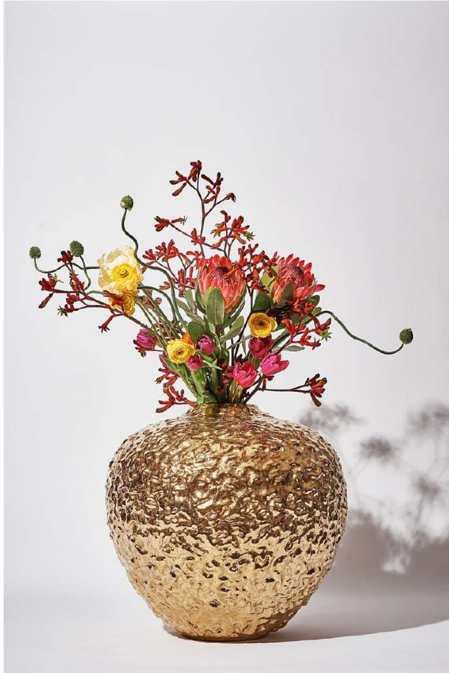
Morten Løbner Espersen Gold Moon , 2016 Glazed stoneware 17.70h x 19.60w in ELM031 $ 23,500.00