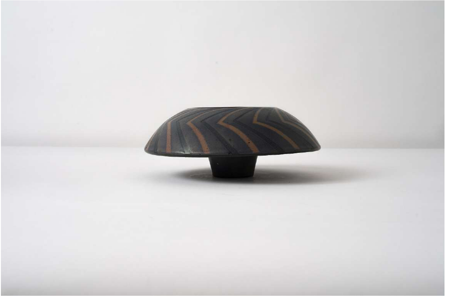
Karl Scheid Mushroom Discus Geometric Bowl , 1991 Glazed Stoneware 3.94h x 9.83w in SCK021 $ 11,000.00