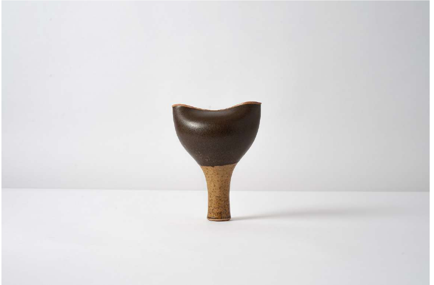
Gotlind Weigel Untitled Glazed Stoneware 7h x 5.25w x 5.25d in WEG012 $ 3,200.00