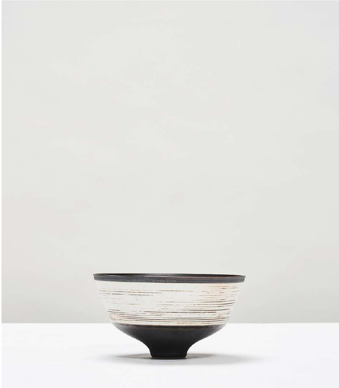
Karl Scheid Kumme Cup , 1977 Glazed Stoneware 3h x 5.60w x 5.60d in SCK020 $ 15,000.00