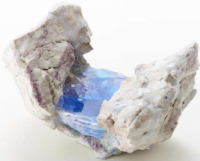
Osamu Kojima Blue 09-m02 , 2009 Stoneware 6h x 9w x 7d in KOO023 $ 4,800.00