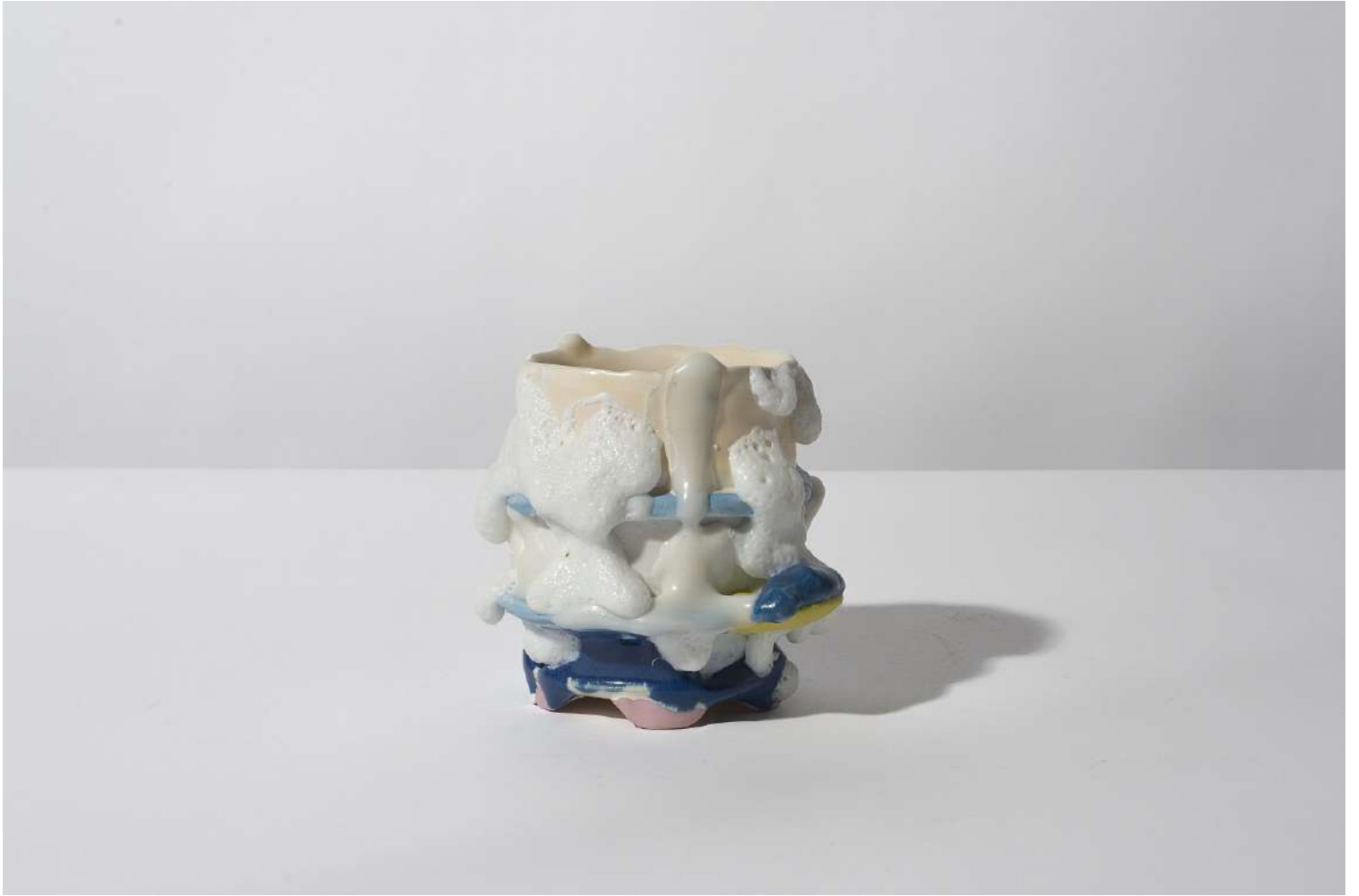
Nick Weddell Insta Cup Glazed Ceramic 4.75h x 5w x 4.50d in NIW0062 $ 1,800.00