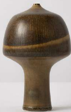
Karl Scheid Mushroom , 1980's Glazed stoneware 6.50h x 4w in SCK032 $ 7,000.00