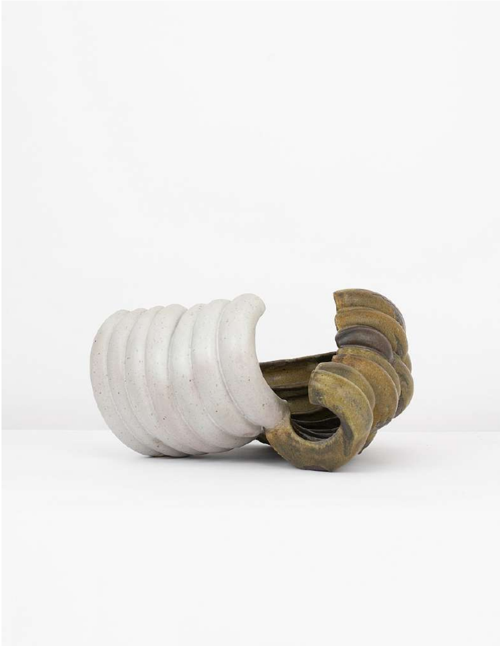
Beate Kuhn Claws , 1970 Glazed Stoneware 10h x 20w x 21d in KUB097 $ 34,000.00