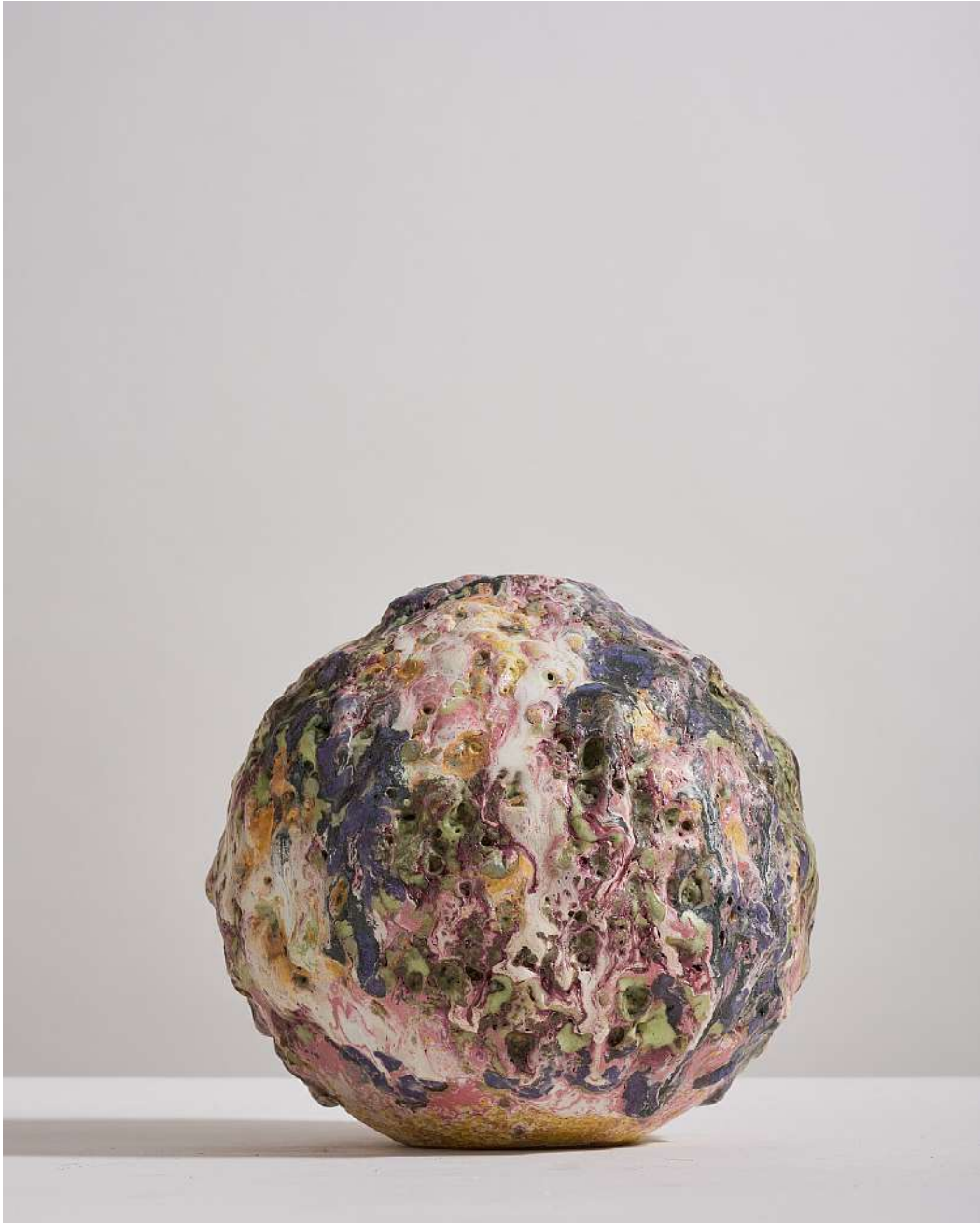
Morten Løbner Espersen Glazed Pearl 8 , 2019 Glazed Stoneware 6.69h x 7.09w x 7.09d in ELM124 $ 2,650.00