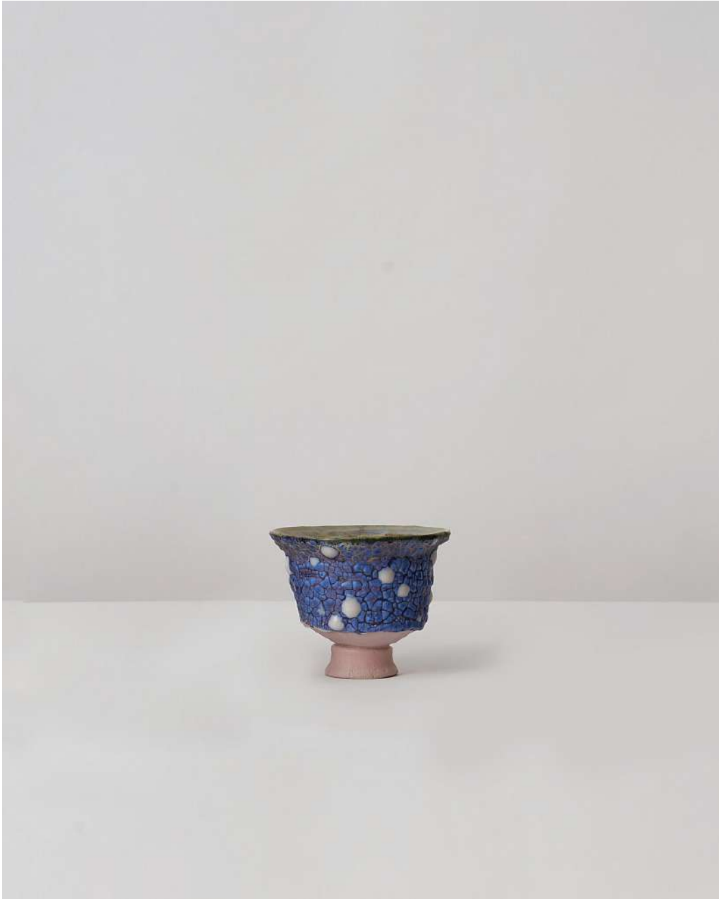
Nick Weddell Where There's Hair There's Pleasure , 2021 Glazed porcelain 3.50h x 4w x 4d in NIW0105 $ 1,800.00