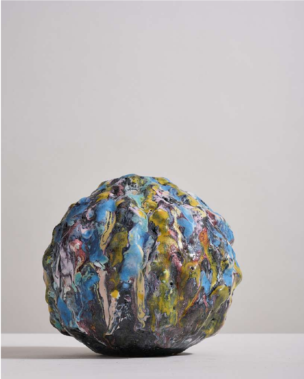
Morten Løbner Espersen Glazed Pearl 7 , 2019 Glazed Stoneware 6.69h x 7.09w x 7.09d in ELM123 $ 2,650.00