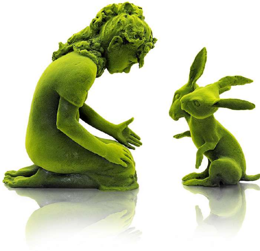
Kim Simonsson Moss Girl and Two Headed Rabbit , 2018 Stoneware and nylon fiber 27.50h in SIK083 $ 45,000.00