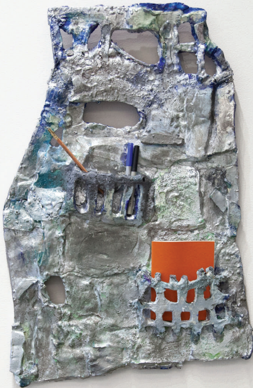
Jillian Mayer Office Organizer 2024, 20 x 30 x 3 in Bronze plated, silver plated, glazes, resins, ceramic, hardware, and office supplies $ 7000