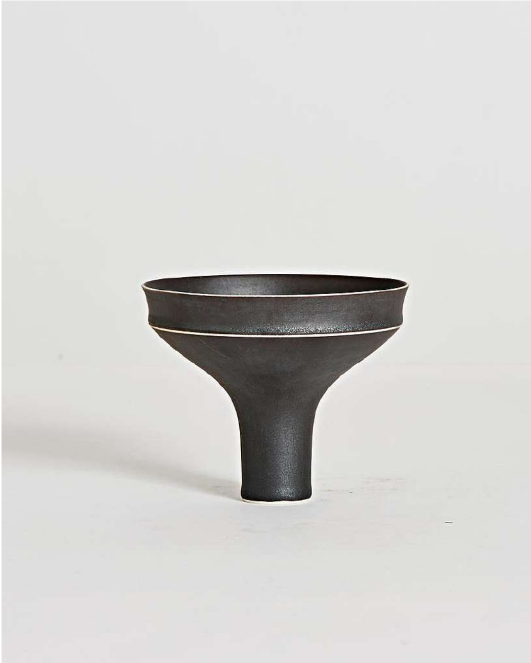
Ursula Scheid Coupe , 1977 Glazed Stoneware 4.25h x 5w in SCU004 $ 8,500.00