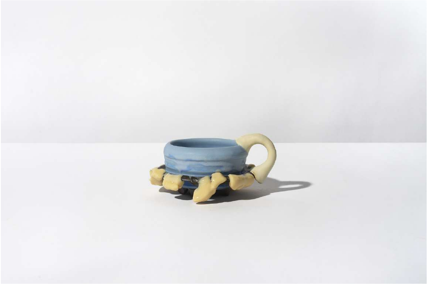
Nick Weddell Egg , 2021 Glazed Stoneware 3.50h x 6w x 5d in NIW0071 $ 1,800.00