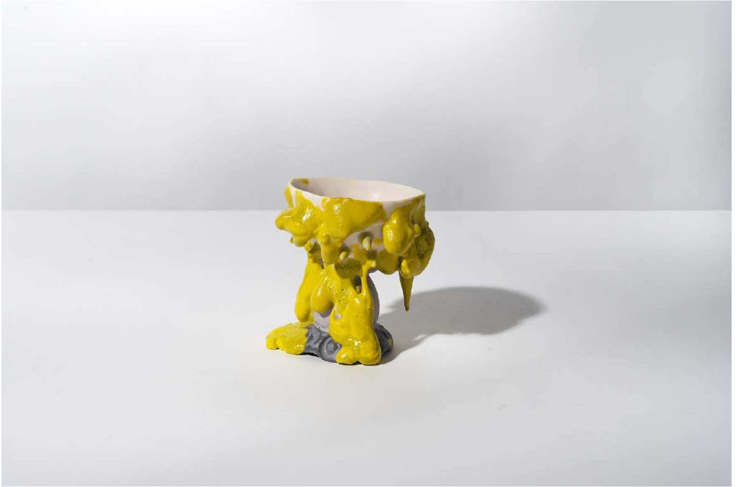
Nick Weddell Freckle , 2021 Glazed porcelain 6h x 4w x 4d in NIW0117 $ 2,400.00