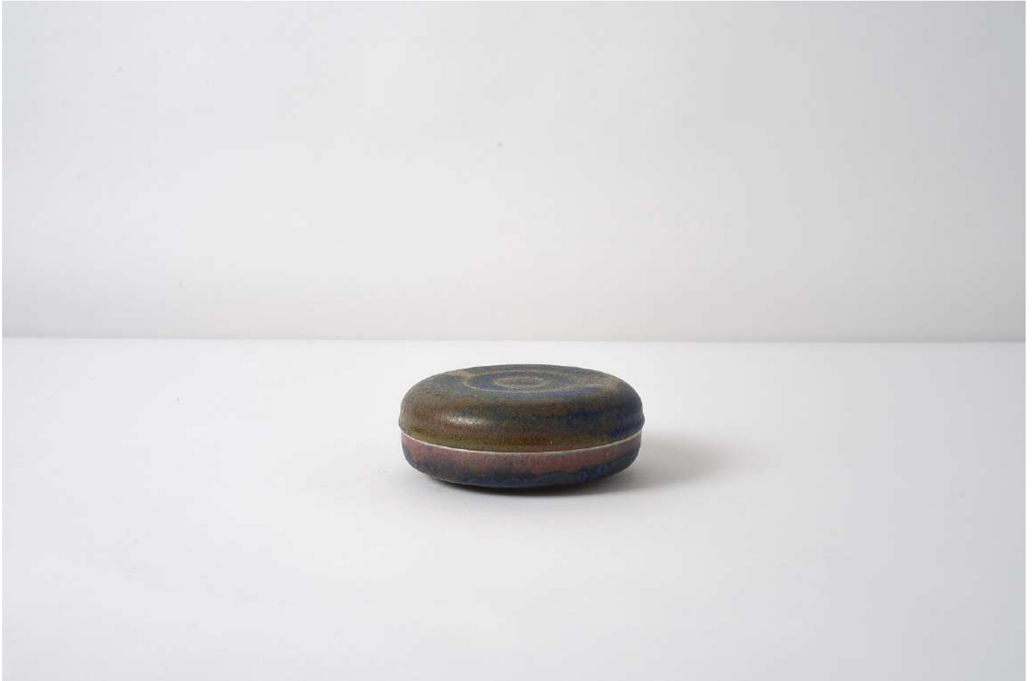
Margarete Schott Untitled , 1960 Glazed Stoneware 2.25h x 5.50w x 5.50d in SCH006 $ 1,800.00