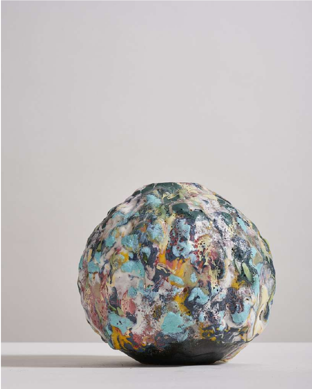
Morten Løbner Espersen Glazed Pearl 2 , 2019 Glazed Stoneware 6.69h x 7.09w x 7.09d in ELM118 $ 2,650.00