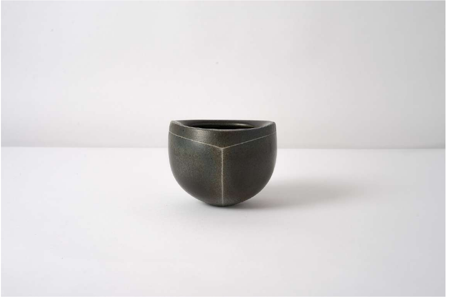
Gotlind Weigel Untitled Glazed Stoneware 4.50h x 5.75w x 5.50d in WEG014 $ 2,800.00