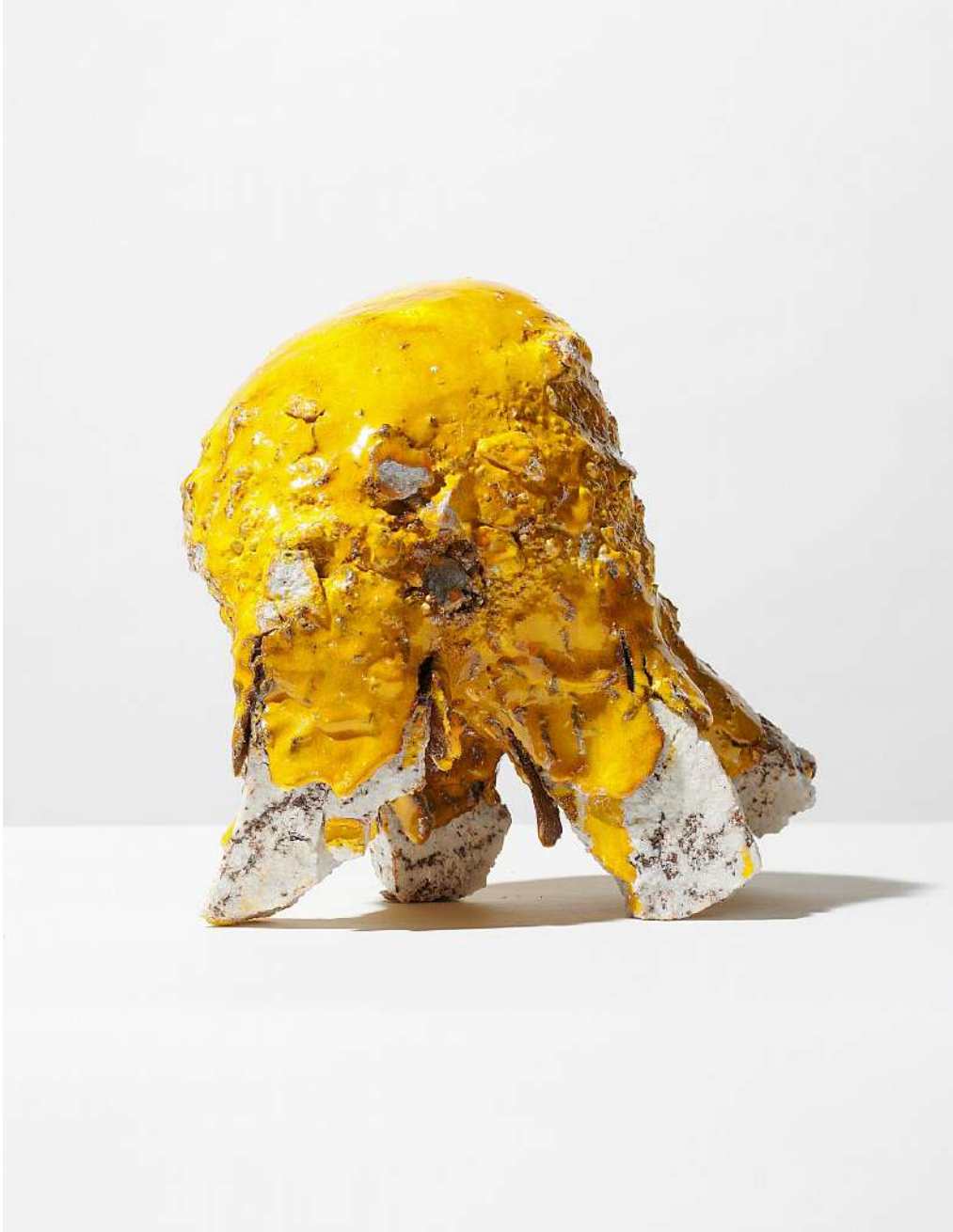
Aneta Regel Escaping, 2020 Stoneware, Porcelain, Volcanic rock components, Glaze, Slips, Resin 12.60h x 8.27w x 11.02d in REA198 $ 6,500.00